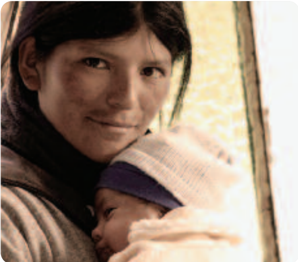
User of maternal health care of the Raul Maldonado Mejia Hospital

The experience takes place in the Health Center No. 12 Raul Maldonado Mejia Hospital located in the Cayambe Canton in the Pichincha province which reports a population of 79,847 inhabitants. 69% of which are Kichwa from the Kayampi village, mostly poor and from rural areas with limited geographic access. These figures show that users