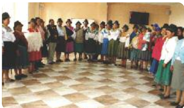
Cayambe midwives participating in training