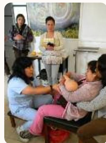
Psychoprophylaxis workshop in the delivery room