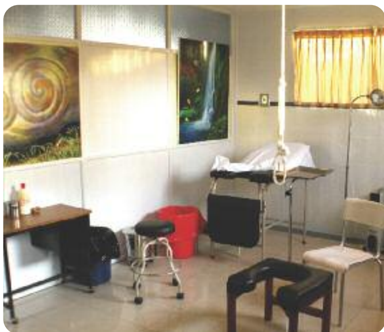
Culturally appropriate delivery room