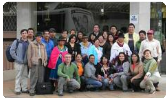
Exchange visit to observe the CAB model by the Provincial Department of Health of Azuay

To implement the knowledge acquired, educational materials were developed for the identification of maternal danger signs and preparation of birth / family emergency plans, which are given out in health centers and the hospital of Health Center No. 12 and by the traditional midwives.