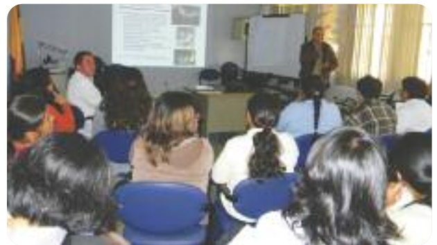
Hospital staff engaged in awareness-raising efforts

To implement the knowledge acquired, educational materials were developed for the identification of maternal danger signs and preparation of birth / family emergency plans, which are given out in health centers and the hospital of Health Center No. 12 and by the traditional midwives.