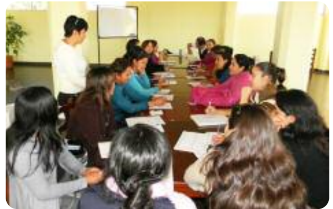
Hospital staff involved in training processes